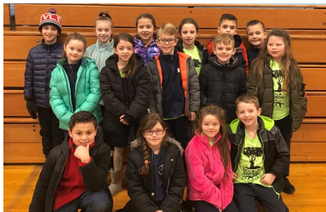
Congratulations To Our First Penance Students!